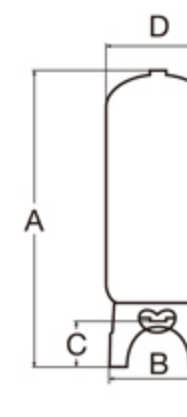
14"-36" top and bottom opening