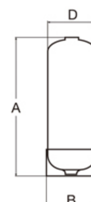
12"-16" top opening