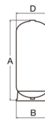
18"-36" top opening